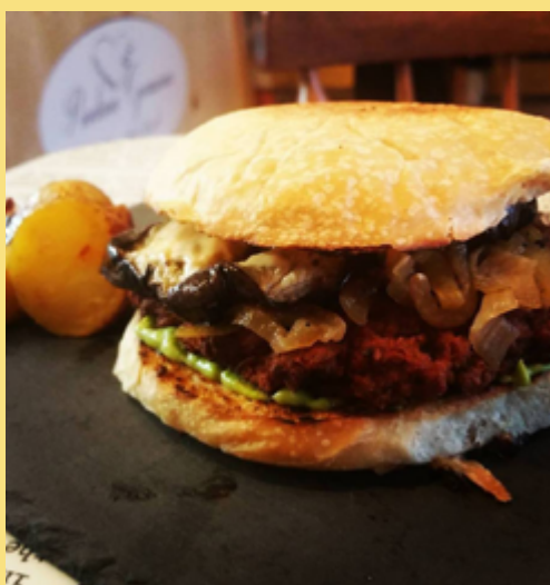
Brand new vegan Italian eatery in Hackney, London: Piadina Genuina