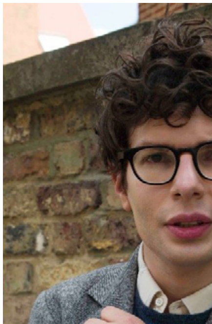
SIMON AMSTELL'S NEW FILM, P15