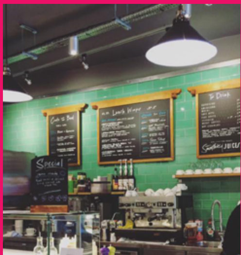
New to Pinner: The Ahimsa Vegan Cafe