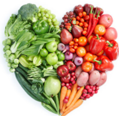
TOP TIPS FOR GOING VEGGIE, P10