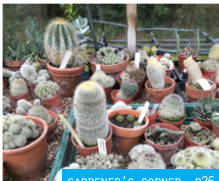
GARDENER'S CORNER, P26