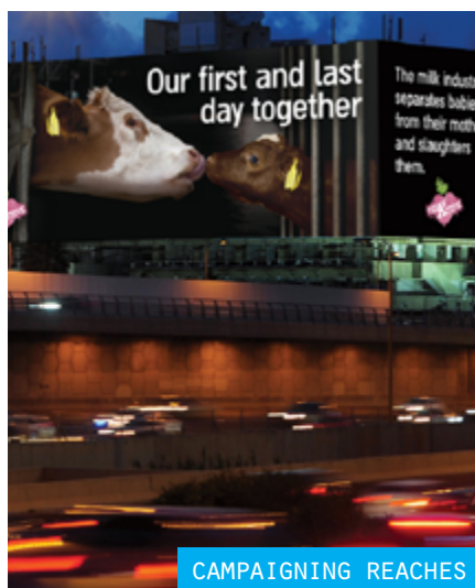
CAMPAINING REACHES NEW HEIGHTS, P26