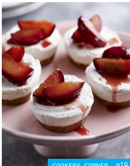
COOKERY CORNER, P19