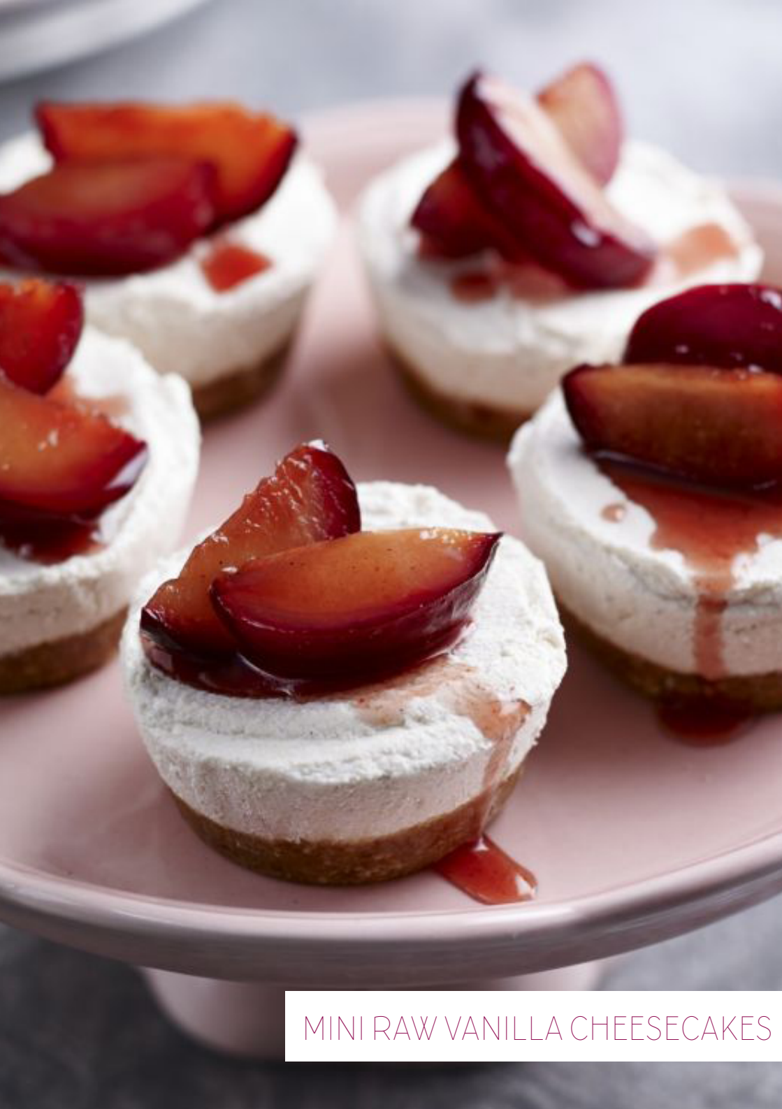
MINI RAW VANILLA CHEESECAKES