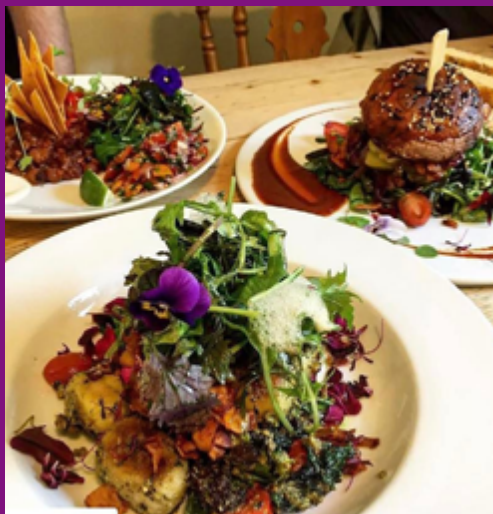
Gluten free & vegan delights; Off Beet in Hampshire