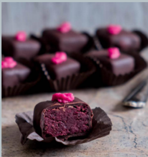
Raw goodies at Rawligion, near Warren Street tube